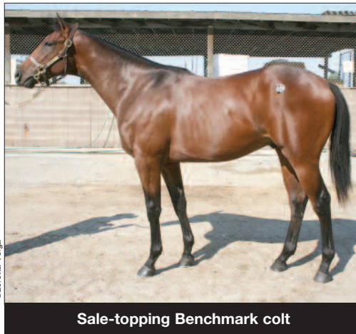
Sale-topping Benchmark colt