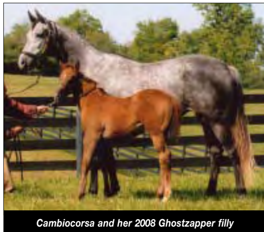
Cambiocorsa and her 2008 Ghostzapper filly